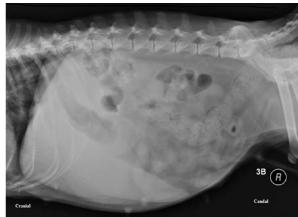
Figure 1. Right lateral abdominal radiograph shows blunting of caudoventral liver margins with extension beyond the costal arch, and caudal displacement of the gastric axis indicating hepatomegaly. Cranial to the left, caudal to the right.

Adrenal tumours can be functional or non-functional. FATs are hormonally active and patients usually are presented with clinical signs (Rijnberk and Kooistra, 2010). Non-functional adrenal tumours however, are endocrinologically silent without clinical signs (Rijnberk and Kooistra, 2010). Examples of FATs are such as adrenocortical carcinomas, adrenocortical adenomas and pheochromocytomas. Examples of non-functional adrenal tumours are incidentaloma and myelolipoma. In this case report, the patient showed clinical signs consistent with HAC and HDDST revealed a lack of suppression, indicating that the adrenal tumour seen in this case was a functional tumour. A biopsy of the mass was not performed due to its invasiveness.