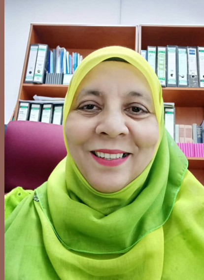
Dr Nazni Wasi Ahmad Infectious Disease Research Centre Ministry of Health Malaysia Malaysia