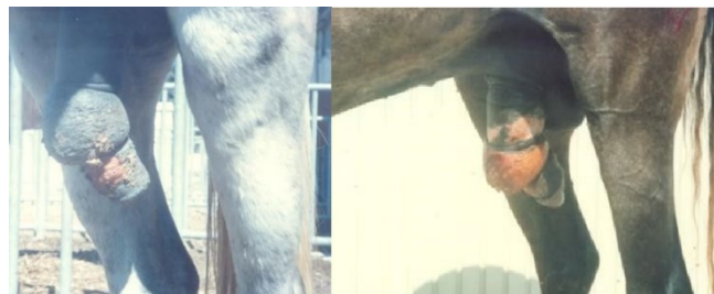
Figure1. Horses with paraphimosis as a result of trauma. Notice the swelling the dorsal aspect of the pines on both cases, which prevents the pines from returning into the prepuce and caused it to be protruded.

Reduction of penile and preputial tissue oedema were attempted by using an antiseptic solution of 1.5%