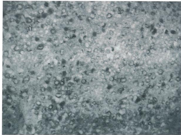
Fig. 3. Photomicrograph of tumour from the nasal cavity of the mongrel. Note the presence of almost uniform cells, compactly arranged in a minimal connective tissue stroma. A number of cells are undergoing apoptosis (arrows) (H&E, X400).

Higgins (1966) suggested that many of the skin sites where the tumour is found represent lesions of biting and scratching. We strongly believed that implantation of TVT in the nasal cavity of male dogs as described in this paper