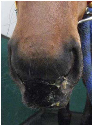
Figure 1. Gelding presented with left unilateral mucopurulent nasal discharge

Australia). The upper respiratory tract structures were found to be normal with the exception of thick green-yellow mucopurulent exudate oozing from the left nasopharyngeal opening.