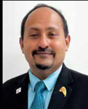
President Elect, World Union of Wound Healing Societies